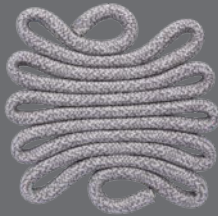
W36 BARLEY NEW