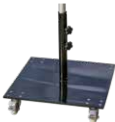
HEAVY BASE PLATE WITH WHEELS