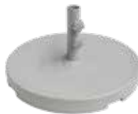
GREY CONCRETE BASE