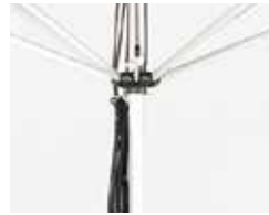
50mm DIAMETER POLE

Frames are made of Marine Grade Anodised Aluminium with a 3 year warranty against mechanical defects.