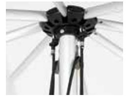
COMMERCIAL DOUBLE PULLEY SYSTEM